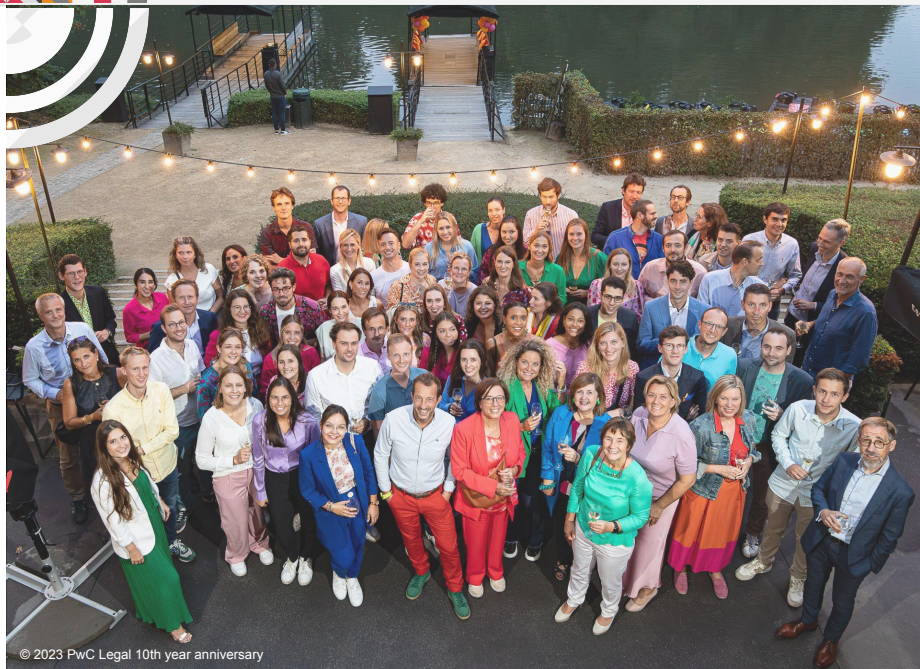
© 2023 PwC Legal 10th year anniversary